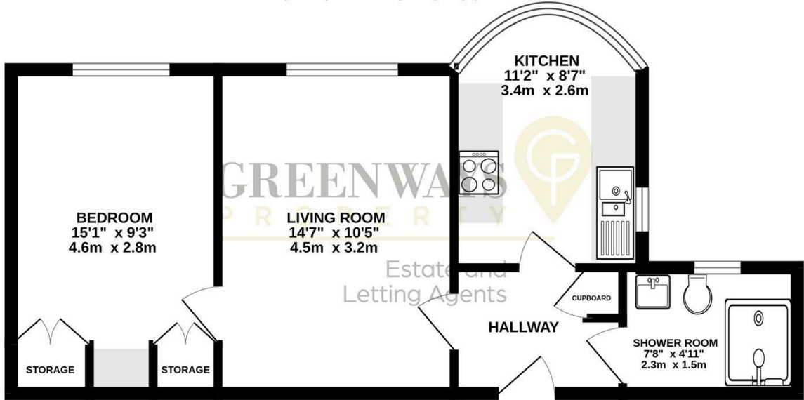
FIFTH FLOOR 473 sq.ft. (43.9 sq.m.) approx.

TOTAL FLOOR AREA : 473 sq.ft. (43.9 sq.m.) approx. Whilst every attempt has been made to ensure the accuracy of the floorplan contained here, measurements of doors, windows, rooms and any other items are approximate and no responsibility is taken for any error, omission or mis-statement. This plan is for illustrative purposes only and should be used as such by any prospective purchaser. The services, systems and appliances shown have not been tested and no guarantee as to their operability or efficiency can be given. Made with Metropix ©2024